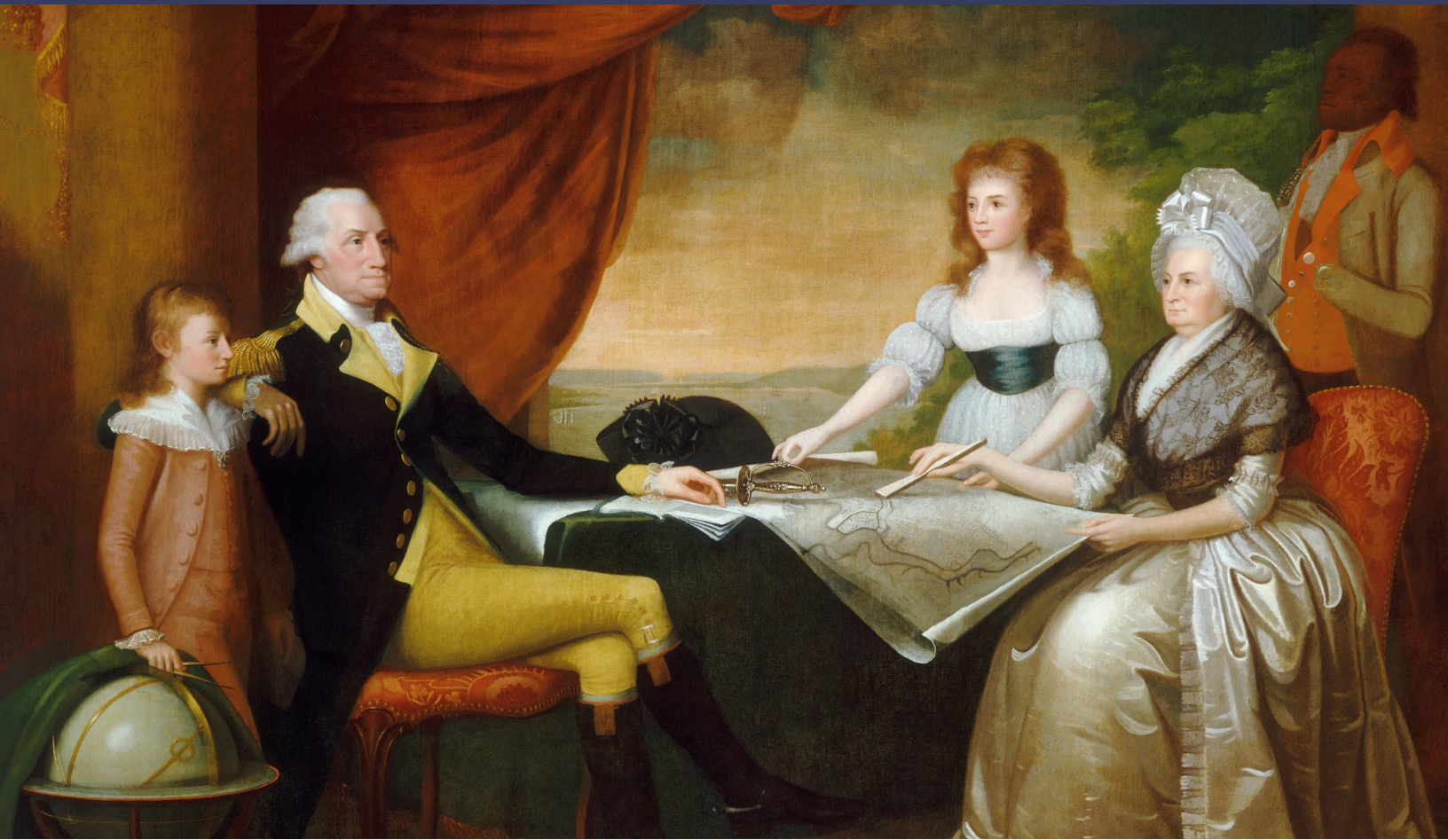
Portrait of the Washington family, painted between 1789 and 1796. L-R: George Washington Parke Custis, George Washington, Eleanor Parke Custis, Martha Washington and an unidentified male slave.

John Parke Custis, the son of Martha Washington and her first husband Daniel Parke Custis, purchased 2,000 acres of the Alexander land in 1778. In 1802, John Parke Custis's son George Washington Parke Custis inherited the plantation, at that time known as Mount Washington, along with a large portion of Martha Washington's collection of furniture, silver, china and family portraits.