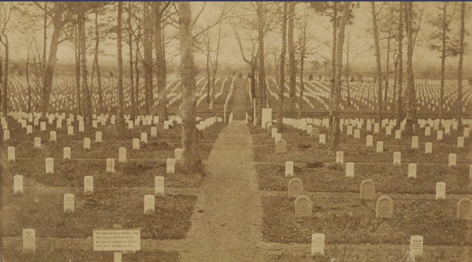
1865 photo of burials in Arlington National Cemetery.

Burials at Arlington National Cemetery continued for the rest of the Civil War and in the years after it. In spite of the graves that surrounded Arlington House, Robert and Mary Lee's son, George Washington Custis Lee, sued the United States government in 1874 for the return of the Arlington property. In 1882, the Supreme Court ruled that the estate had been illegally confiscated and returned the property to George Washington Custis Lee. To avoid disinterring the 20,000 soldiers already buried in the cemetery, the federal government negotiated with Lee, and on March 31, 1883, he agreed to sell the property to the government for $150,000.