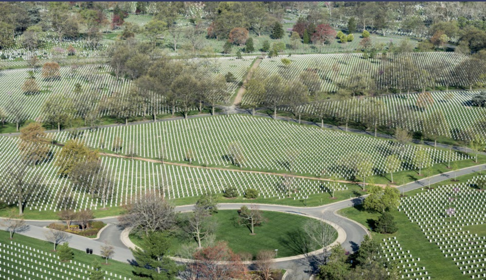
Aerial view of Arlington National Cemetery, looking northwest from Patton Circle.