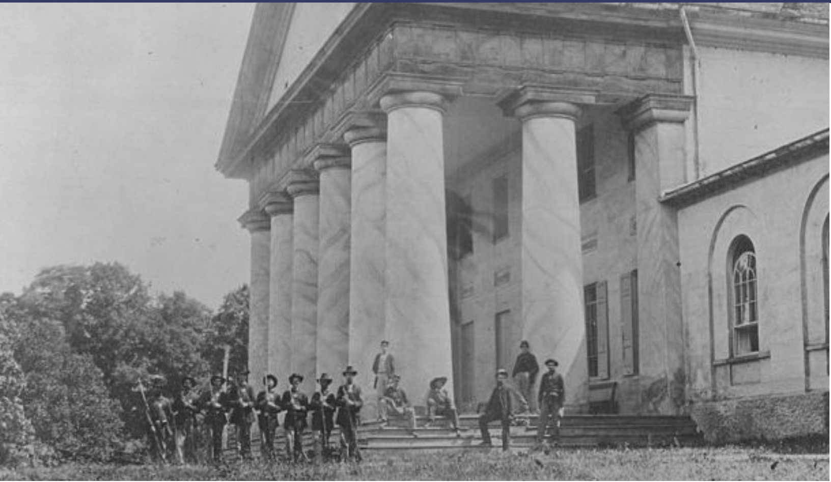
U.S. soldiers on the steps of Arlington House, 1864.

The U.S. Army recognized the strategic importance of acquiring this high ground that directly overlooked Washington, D.C. in order to protect the capital city. On May 23, 1861, the U.S. Army occupied the Arlington property. It used the house as a headquarters and officers' housing, while soldiers camped around the property. The Army cut down many acres of forest in order to build multiple forts on the land.